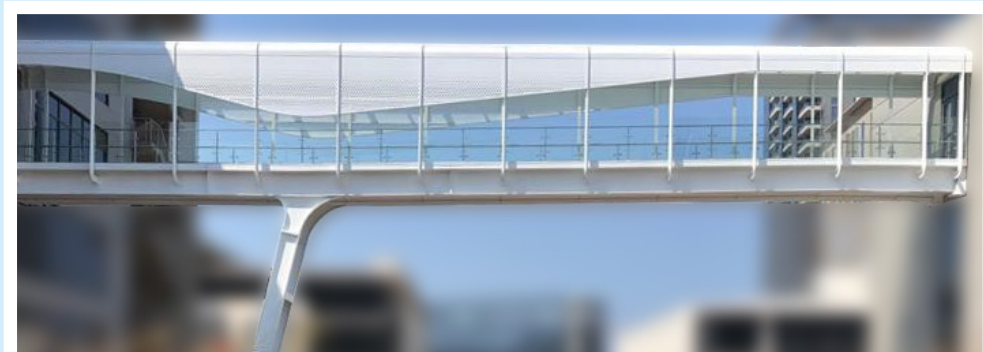
DESIGN OF PROPOSED CONNECTING BRIDGE

The original Gandhi Desai School, had been built by Kathiawad Hindu Seva Samaj (Samaj) in the 1950's. When the school was closed by the withdrawal of the Government support in 1992, the school had been let to a private school operator. Samaj donated rentals of about R9 million, (from 2008 to date) to Kendra to support Kendra activities. Due to difficult times, the school tenant vacated one-third of the school this year and is expected to vacate totally next year. Numerous attempts to find suitable alternate tenants has proved unsuccessful.